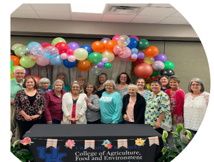
Mountain Laurel Quilters

Join us in congratulating Macedonia in having the largest percentage of members to attend our annual meeting. And a huge congratulations to Mountain Laurel Quilters who had volunteered a combined total of 7,472 hours!